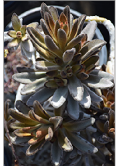
Chocolate Soldier Panda Plant

This is an herbaceous evergreen houseplant with a mounded form. This plant may benefit from an occasional pruning to look its best.