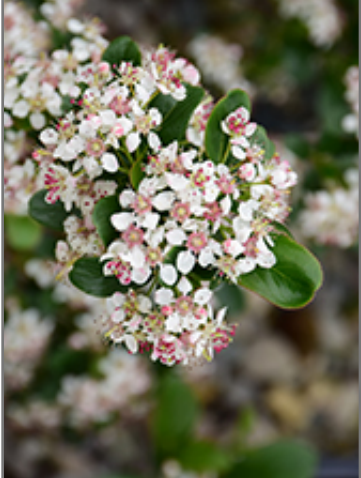
Low Scape Mound Aronia flowers

We are so proud of the nursery stock that we have carefully selected for superior quality and performance, WE GUARANTEE ALL TREES, SHRUBS, EVERGREENS FOR 2 YEARS, AND ROSES FOR 1 YEAR!