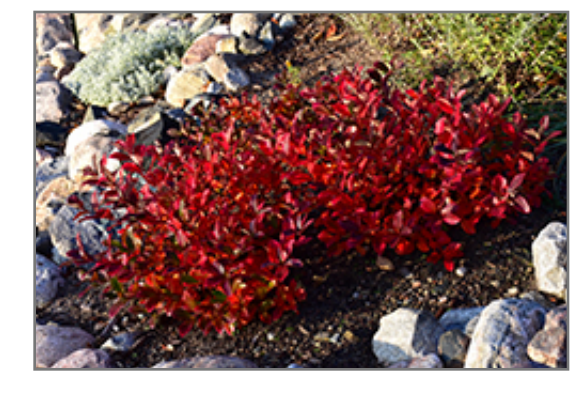
Low Scape Mound Aronia in fall

Low Scape Mound Aronia will grow to be about 24 inches tall at maturity, with a spread of 24 inches. When grown in masses or used as a bedding plant, individual plants should be spaced approximately 18 inches apart. It tends to fill out right to the ground and therefore doesn't necessarily require facer plants in front. It grows at a slow rate, and under ideal conditions can be expected to live for approximately 20 years.