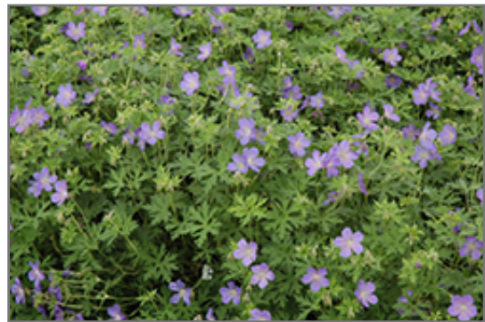
Johnson's Blue Cranesbill in bloom

We are so proud of the nursery stock that we have carefully selected for superior quality and performance, WE GUARANTEE ALL TREES, SHRUBS, EVERGREENS FOR 2 YEARS, AND ROSES FOR 1 YEAR!