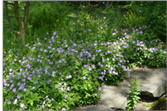
Spotted Cranesbill in bloom