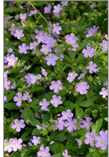
Spotted Cranesbill flowers

Spotted Cranesbill is an herbaceous perennial with a mounded form. Its relatively fine texture sets it apart from other garden plants with less refined foliage.