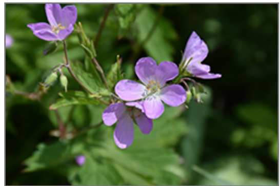
Spotted Cranesbill flowers

We are so proud of the nursery stock that we have carefully selected for superior quality and performance, WE GUARANTEE ALL TREES, SHRUBS, EVERGREENS FOR 2 YEARS, AND ROSES FOR 1 YEAR!