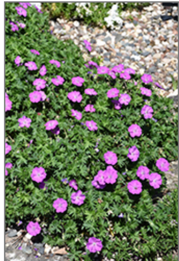
Alpenglow Cranesbill flowers

We are so proud of the nursery stock that we have carefully selected for superior quality and performance, WE GUARANTEE ALL TREES, SHRUBS, EVERGREENS FOR 2 YEARS, AND ROSES FOR 1 YEAR!