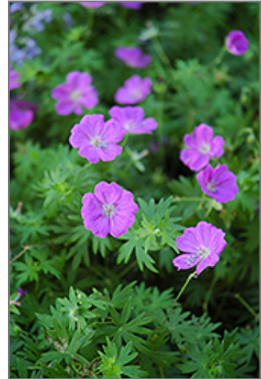
Alpenglow Cranesbill flowers

This is a relatively low maintenance plant, and should only be pruned after flowering to avoid removing any of the current season's flowers. It is a good choice for attracting butterflies to your yard, but is not particularly attractive to deer who tend to leave it alone in favor of tastier treats. It has no significant negative characteristics.