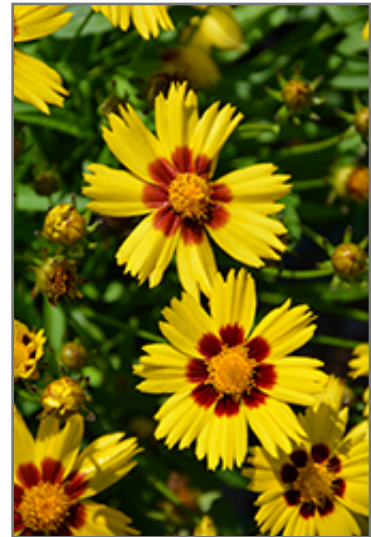
Sunkiss Tickseed flowers

Sunkiss Tickseed is recommended for the following landscape applications;