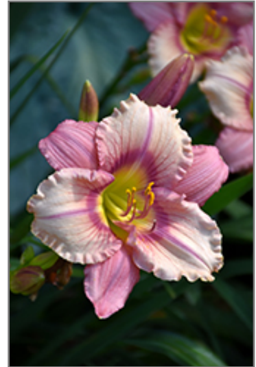
Happy Ever Appster Stephanie Returns Daylily flowers

Happy Ever Appster Stephanie Returns Daylily is recommended for the following landscape applications;