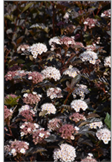
Petite Plum Ninebark flowers

Petite Plum Ninebark is recommended for the following landscape applications;