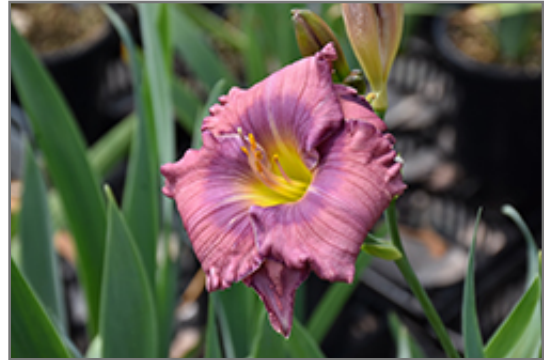
Lavender Blue Baby Daylily flowers

We are so proud of the nursery stock that we have carefully selected for superior quality and performance, WE GUARANTEE ALL TREES, SHRUBS, EVERGREENS FOR 2 YEARS, AND ROSES FOR 1 YEAR!