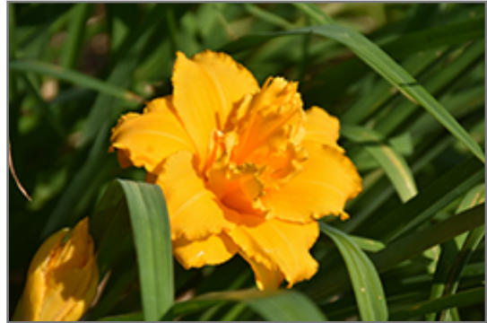
Chesapeake Crablegs Daylily flowers

We are so proud of the nursery stock that we have carefully selected for superior quality and performance, WE GUARANTEE ALL TREES, SHRUBS, EVERGREENS FOR 2 YEARS, AND ROSES FOR 1 YEAR!