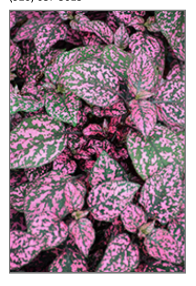
Hippo Rose Polka Dot Plant foliage

This is a relatively low maintenance plant, and should not require much pruning, except when necessary, such as to remove dieback. Deer don't particularly care for this plant and will usually leave it alone in favor of tastier treats. It has no significant negative characteristics.