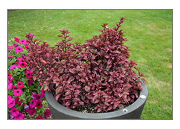
Hippo Rose Polka Dot Plant