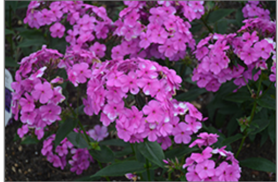
Cloudburst Phlox flowers

We are so proud of the nursery stock that we have carefully selected for superior quality and performance, WE GUARANTEE ALL TREES, SHRUBS, EVERGREENS FOR 2 YEARS, AND ROSES FOR 1 YEAR!