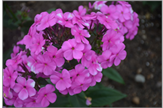
Cloudburst Phlox flowers

Cloudburst Phlox is recommended for the following landscape applications;