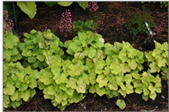
Primo Pretty Pistachio Coral Bells