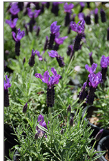
Javelin Forte Deep Purple Lavender flowers

This is a relatively low maintenance plant, and can be pruned at anytime. It is a good choice for attracting bees and butterflies to your yard, but is not particularly attractive to deer who tend to leave it alone in favor of tastier treats. It has no significant negative characteristics.