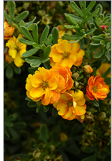
Marmalade Potentilla flowers

Marmalade Potentilla is a dense multi-stemmed deciduous shrub with a more or less rounded form. Its relatively fine texture sets it apart from other landscape plants with less refined foliage.