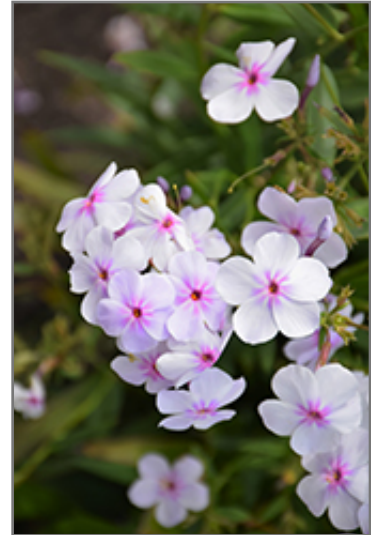
Opening Act Pink-A-Dot Phlox flowers

Opening Act Pink-A-Dot Phlox is recommended for the following landscape applications;