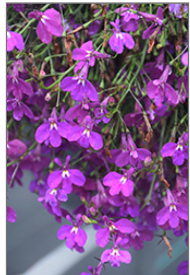
Laguna Ultraviolet Lobelia flowers

We are so proud of the nursery stock that we have carefully selected for superior quality and performance, WE GUARANTEE ALL TREES, SHRUBS, EVERGREENS FOR 2 YEARS, AND ROSES FOR 1 YEAR!