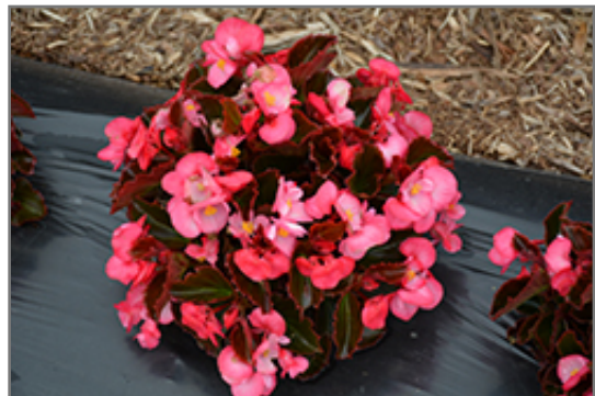
Senator IQ Deep Rose in bloom

We are so proud of the nursery stock that we have carefully selected for superior quality and performance, WE GUARANTEE ALL TREES, SHRUBS, EVERGREENS FOR 2 YEARS, AND ROSES FOR 1 YEAR!