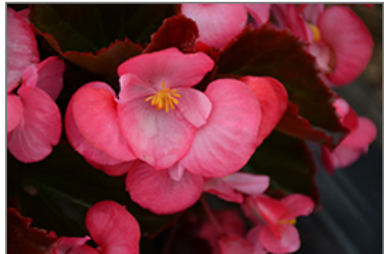
Senator IQ Deep Rose flowers

This is a high maintenance plant that will require regular care and upkeep, and usually looks its best without pruning, although it will tolerate pruning. Deer don't particularly care for this plant and will usually leave it alone in favor of tastier treats. Gardeners should be aware of the following characteristic(s) that may warrant special consideration;