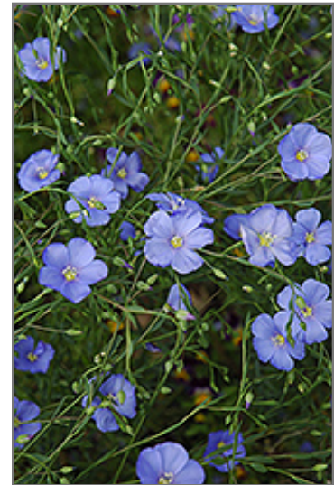
Perennial Flax flowers

We are so proud of the nursery stock that we have carefully selected for superior quality and performance, WE GUARANTEE ALL TREES, SHRUBS, EVERGREENS FOR 2 YEARS, AND ROSES FOR 1 YEAR!