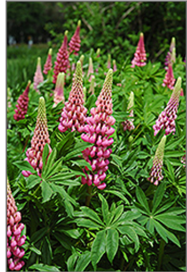
Russell Red Lupine flowers

We are so proud of the nursery stock that we have carefully selected for superior quality and performance, WE GUARANTEE ALL TREES, SHRUBS, EVERGREENS FOR 2 YEARS, AND ROSES FOR 1 YEAR!