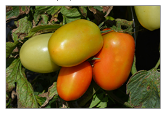
Roma VF Tomato fruit