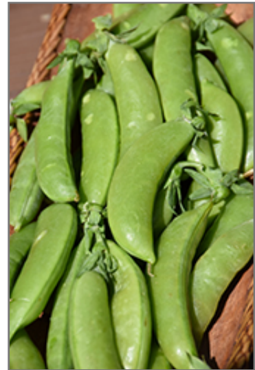
Sugar Snap Pea fruit

Sugar Snap Pea will grow to be about 6 feet tall at maturity, with a spread of 24 inches. When planted in rows, individual plants should be spaced approximately 24 inches apart. Because of its vigorous growth habit, it may require staking or supplemental support. This fast-growing vegetable plant is an annual, which means that it will grow for one season in your garden and then die after producing a crop.