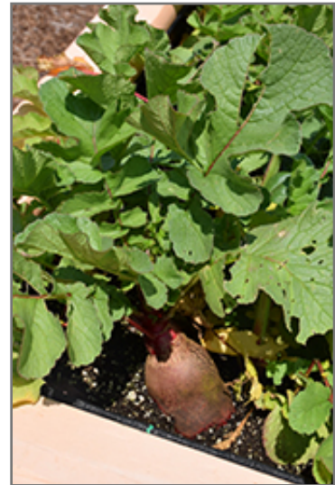
Roxanne Radish fruit

Roxanne Radish will grow to be about 8 inches tall at maturity, with a spread of 6 inches. When planted in rows, individual plants should be spaced approximately 2 inches apart. This vegetable plant is an annual, which means that it will grow for one season in your garden and then die after producing a crop. Because of its relatively short time to maturity, it lends itself to a series of successive plantings each staggered by a week or two; this will prolong the effective harvest period.