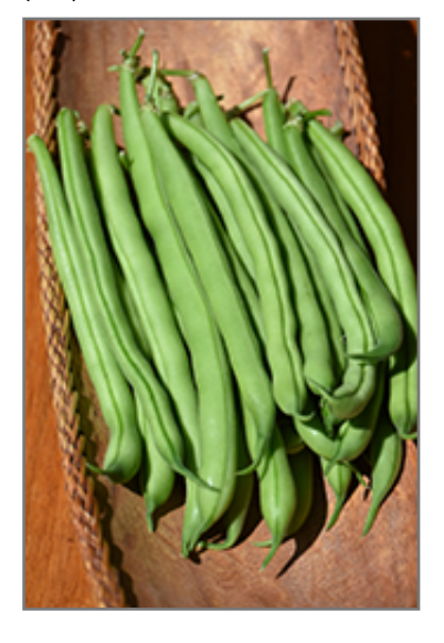
Blue Lake Bush Bean fruit

A beautiful compact bushy variety, producing high yields all season long; 6 inch long, dark green pods that are string-less, plump and flavorful; perfect for fresh eating, canning and freezing; harvest early and often to encourage season long production