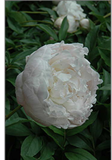
Myrtle Gentry Peony flowers