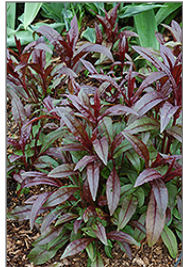
Husker Red Beard Tongue foliage

We are so proud of the nursery stock that we have carefully selected for superior quality and performance, WE GUARANTEE ALL TREES, SHRUBS, EVERGREENS FOR 2 YEARS, AND ROSES FOR 1 YEAR!