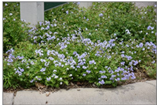
Creeping Jacob's Ladder in bloom

We are so proud of the nursery stock that we have carefully selected for superior quality and performance, WE GUARANTEE ALL TREES, SHRUBS, EVERGREENS FOR 2 YEARS, AND ROSES FOR 1 YEAR!