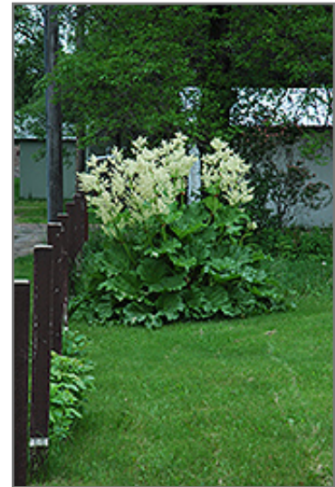
Garden Rhubarb in bloom

Garden Rhubarb features bold spikes of white flowers rising above the foliage from early to mid summer. Its enormous crinkled round leaves remain green in color throughout the season. The red stems are very colorful and add to the overall interest of the plant.