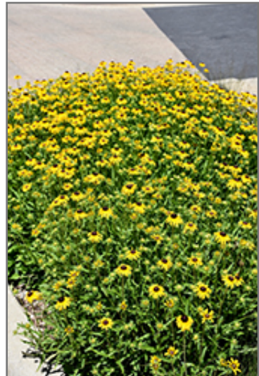
Viette's Little Suzy Coneflower in bloom