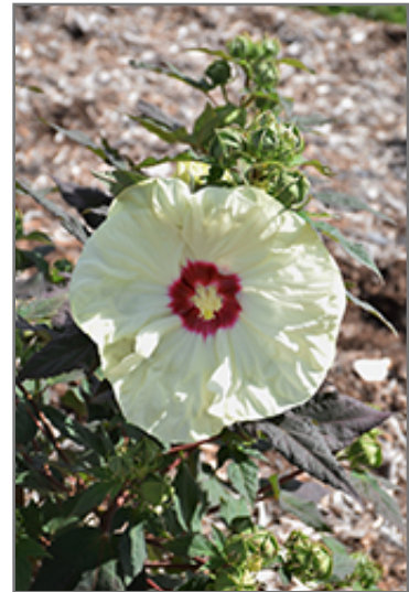
Summerific French Vanilla Hibiscus flowers