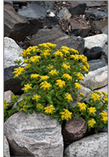
Russian Stonecrop in bloom

Russian Stonecrop is recommended for the following landscape applications;