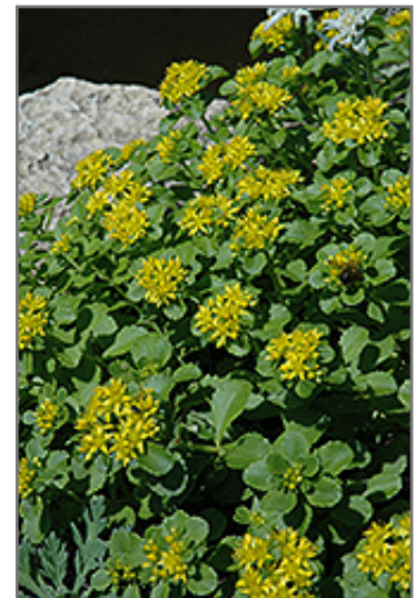
Russian Stonecrop flowers

We are so proud of the nursery stock that we have carefully selected for superior quality and performance, WE GUARANTEE ALL TREES, SHRUBS, EVERGREENS FOR 2 YEARS, AND ROSES FOR 1 YEAR!