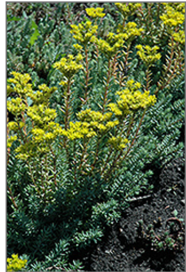
Blue Spruce Stonecrop flowers

We are so proud of the nursery stock that we have carefully selected for superior quality and performance, WE GUARANTEE ALL TREES, SHRUBS, EVERGREENS FOR 2 YEARS, AND ROSES FOR 1 YEAR!