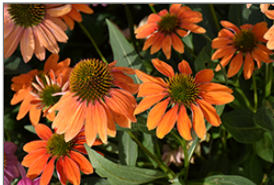
Artisan Soft Orange Coneflower flowers

Artisan Soft Orange Coneflower is an herbaceous perennial with an upright spreading habit of growth. Its medium texture blends into the garden, but can always be balanced by a couple of finer or coarser plants for an effective composition.