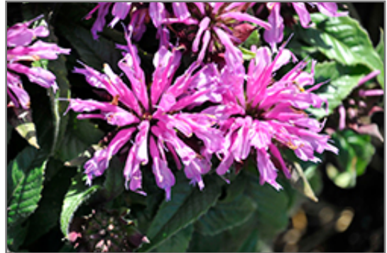
Pardon My Lavender Beebalm flowers

A petite form of bee balm that produces multitudes of striking lavender pink flowers in mid summer; this very compact form is mildew resistant as well; great for massing in the front of borders