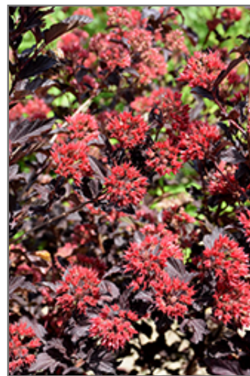
Center Glow Ninebark fruit

We are so proud of the nursery stock that we have carefully selected for superior quality and performance, WE GUARANTEE ALL TREES, SHRUBS, EVERGREENS FOR 2 YEARS, AND ROSES FOR 1 YEAR!