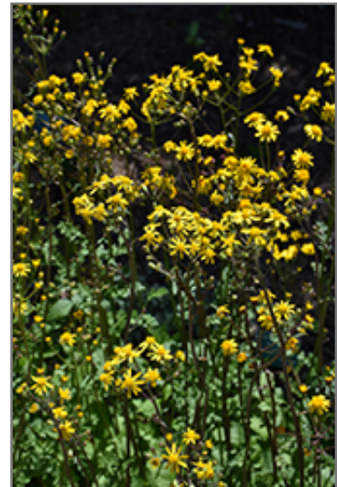
Golden Ragwort flowers

We are so proud of the nursery stock that we have carefully selected for superior quality and performance, WE GUARANTEE ALL TREES, SHRUBS, EVERGREENS FOR 2 YEARS, AND ROSES FOR 1 YEAR!