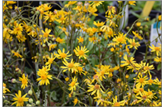
Golden Ragwort flowers