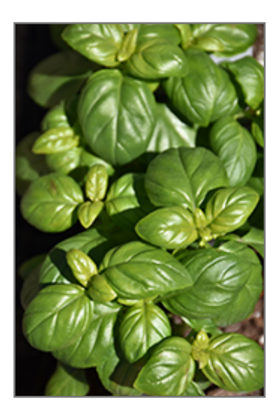
Everleaf Emerald Towers Basil foliage