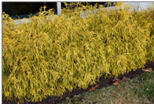
Golden Charm Falsecypress foliage

This shrub does best in full sun to partial shade. It prefers to grow in average to moist conditions, and shouldn't be allowed to dry out. It is not particular as to soil type, but has a definite preference for acidic soils. It is highly tolerant of urban pollution and will even thrive in inner city environments. Consider applying a thick mulch around the root zone in winter to protect it in exposed locations or colder microclimates. This is a selected variety of a species not originally from North America.