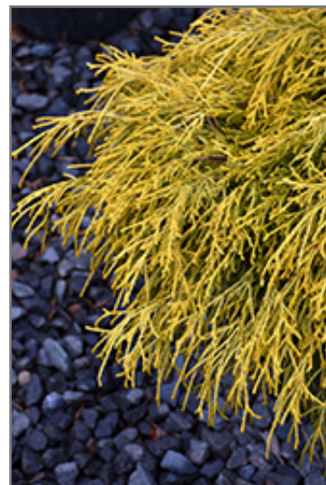
Golden Charm Falsecypress foliage

We are so proud of the nursery stock that we have carefully selected for superior quality and performance, WE GUARANTEE ALL TREES, SHRUBS, EVERGREENS FOR 2 YEARS, AND ROSES FOR 1 YEAR!