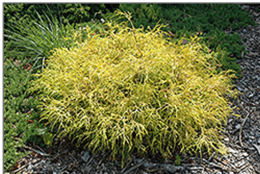
Golden Charm Falsecypress

Golden Charm Falsecypress is a multi-stemmed evergreen shrub with a distinctive and refined pyramidal form. It lends an extremely fine and delicate texture to the landscape composition which can make it a great accent feature on this basis alone.