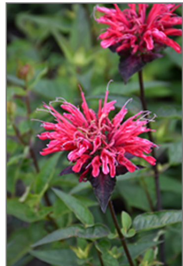
Upscale Red Velvet Beebalm flowers

We are so proud of the nursery stock that we have carefully selected for superior quality and performance, WE GUARANTEE ALL TREES, SHRUBS, EVERGREENS FOR 2 YEARS, AND ROSES FOR 1 YEAR!