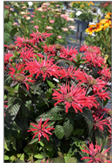
Upscale Red Velvet Beebalm flowers

Upscale Red Velvet Beebalm is an herbaceous perennial with a mounded form. Its medium texture blends into the garden, but can always be balanced by a couple of finer or coarser plants for an effective composition.