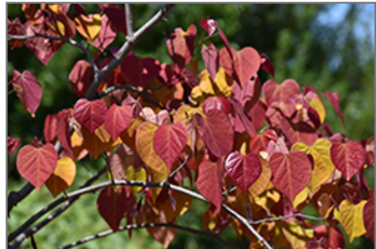
Flame Thrower Redbud foliage

Flame Thrower Redbud is a deciduous tree with an upright spreading habit of growth. Its relatively coarse texture can be used to stand it apart from other landscape plants with finer foliage.