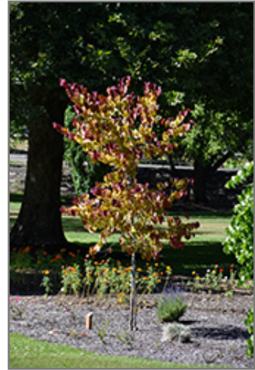
Flame Thrower Redbud

This tree does best in full sun to partial shade. It prefers to grow in average to moist conditions, and shouldn't be allowed to dry out. To help this plant achieve its best flowering performance, periodically apply a flower-boosting fertilizer from early spring through into the active growing season. It is not particular as to soil type or pH. It is highly tolerant of urban pollution and will even thrive in inner city environments, and will benefit from being planted in a relatively sheltered location. Consider applying a thick mulch around the root zone in winter to protect it in exposed locations or colder microclimates. This is a selection of a native North American species.