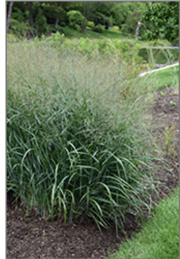
Prairie Dog Switch Grass in bloom

We are so proud of the nursery stock that we have carefully selected for superior quality and performance, WE GUARANTEE ALL TREES, SHRUBS, EVERGREENS FOR 2 YEARS, AND ROSES FOR 1 YEAR!