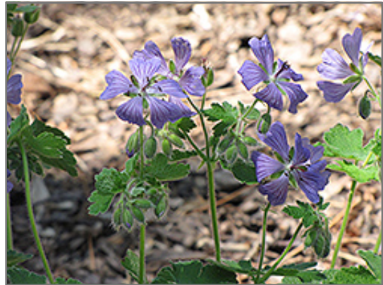
Philippe Vapelle Cranesbill flowers

Philippe Vapelle Cranesbill is recommended for the following landscape applications;