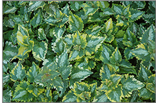
Golden Anniversary Spotted Dead Nettle foliage

We are so proud of the nursery stock that we have carefully selected for superior quality and performance, WE GUARANTEE ALL TREES, SHRUBS, EVERGREENS FOR 2 YEARS, AND ROSES FOR 1 YEAR!