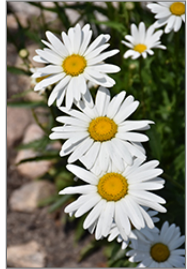
Silver Princess Shasta Daisy flowers

Silver Princess Shasta Daisy is recommended for the following landscape applications;