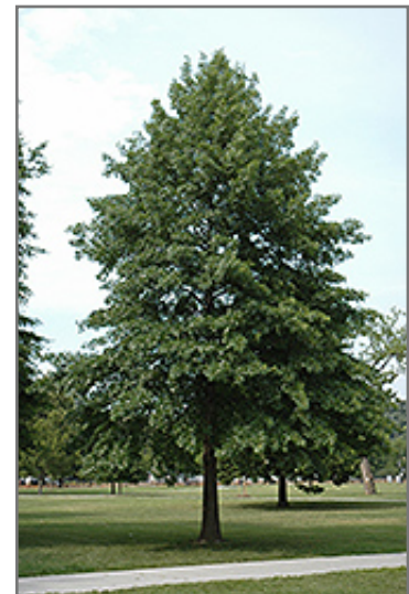
Pin Oak

We are so proud of the nursery stock that we have carefully selected for superior quality and performance, WE GUARANTEE ALL TREES, SHRUBS, EVERGREENS FOR 2 YEARS, AND ROSES FOR 1 YEAR!