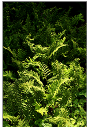
Lady Fern foliage

We are so proud of the nursery stock that we have carefully selected for superior quality and performance, WE GUARANTEE ALL TREES, SHRUBS, EVERGREENS FOR 2 YEARS, AND ROSES FOR 1 YEAR!