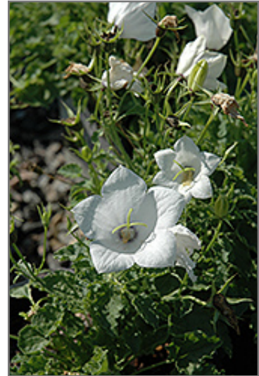
White Uniform Bellflower flowers

We are so proud of the nursery stock that we have carefully selected for superior quality and performance, WE GUARANTEE ALL TREES, SHRUBS, EVERGREENS FOR 2 YEARS, AND ROSES FOR 1 YEAR!