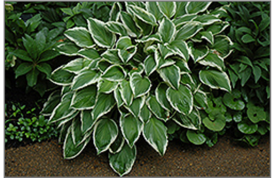
So Sweet Hosta

So Sweet Hosta is a dense herbaceous perennial with tall flower stalks held atop a low mound of foliage. Its medium texture blends into the garden, but can always be balanced by a couple of finer or coarser plants for an effective composition.