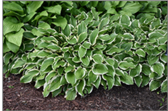
So Sweet Hosta

So Sweet Hosta will grow to be about 12 inches tall at maturity extending to 18 inches tall with the flowers, with a spread of 12 inches. When grown in masses or used as a bedding plant, individual plants should be spaced approximately 10 inches apart. Its foliage tends to remain dense right to the ground, not requiring facer plants in front. It grows at a medium rate, and under ideal conditions can be expected to live for approximately 10 years. As an herbaceous perennial, this plant will usually die back to the crown each winter, and will regrow from the base each spring. Be careful not to disturb the crown in late winter when it may not be readily seen!