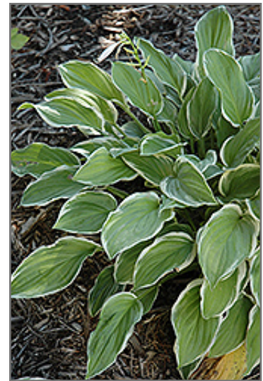
So Sweet Hosta foliage

We are so proud of the nursery stock that we have carefully selected for superior quality and performance, WE GUARANTEE ALL TREES, SHRUBS, EVERGREENS FOR 2 YEARS, AND ROSES FOR 1 YEAR!