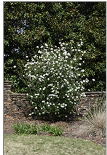
Burkwood Viburnum in bloom

We are so proud of the nursery stock that we have carefully selected for superior quality and performance, WE GUARANTEE ALL TREES, SHRUBS, EVERGREENS FOR 2 YEARS, AND ROSES FOR 1 YEAR!