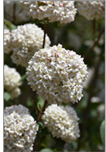
Burkwood Viburnum flowers

Burkwood Viburnum is recommended for the following landscape applications;