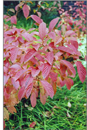
Burkwood Viburnum in fall

This shrub does best in full sun to partial shade. It prefers to grow in average to moist conditions, and shouldn't be allowed to dry out. It is not particular as to soil type or pH. It is highly tolerant of urban pollution and will even thrive in inner city environments. This particular variety is an interspecific hybrid.