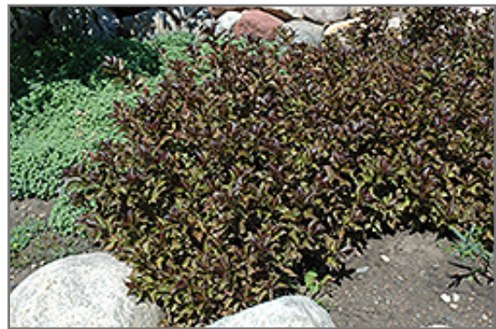
Dark Horse Weigela

We are so proud of the nursery stock that we have carefully selected for superior quality and performance, WE GUARANTEE ALL TREES, SHRUBS, EVERGREENS FOR 2 YEARS, AND ROSES FOR 1 YEAR!