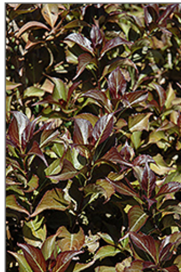
Dark Horse Weigela foliage

Dark Horse Weigela makes a fine choice for the outdoor landscape, but it is also well-suited for use in outdoor pots and containers. Because of its height, it is often used as a 'thriller' in the 'spiller-thriller-filler' container combination; plant it near the center of the pot, surrounded by smaller plants and those that spill over the edges. It is even sizeable enough that it can be grown alone in a suitable container. Note that when grown in a container, it may not perform exactly as indicated on the tag - this is to be expected. Also note that when growing plants in outdoor containers and baskets, they may require more frequent waterings than they would in the yard or garden. Be aware that in our climate, most plants cannot be expected to survive the winter if left in containers outdoors, and this plant is no exception. Contact our experts for more information on how to protect it over the winter months.